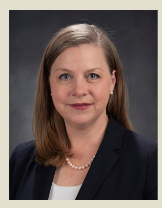
Governor Michelle Bowman

The COVID-19 pandemic has caused unprecedented disruption and hardship in nearly every aspect of our lives, and it continues to weigh heavily on our nation. Since the last publication of Community Banking Connections , economic activity has turned around and we are seeing re-openings across